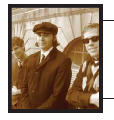
"Style is very much based in the 60's, from The Beatles and the Beach Boys to the garage rockers of the 60's, as is evident on the Australia-Only Sunflower EP the band has produced for their forth coming tour"